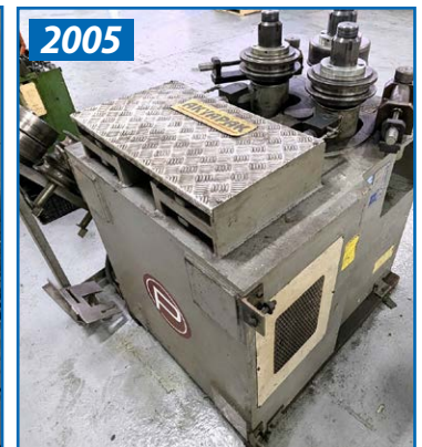
AKYAPAK APK-80 HYDRAULIC ANGLE ROLLS