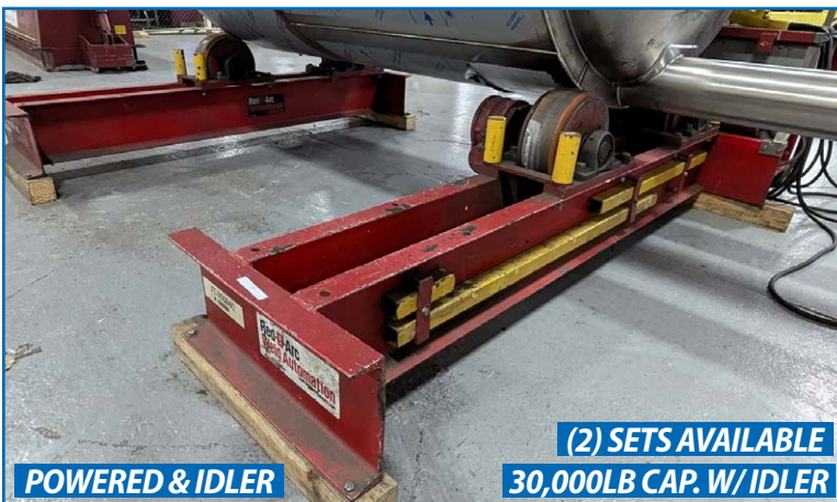
RED-D-ARCTANK TURNING ROLLS

MICROWEILY TY-18455 Lathe, Heidenhain 2-Axis DRO, 10" 3-Jaw Chuck, 18" Swing, 45" Between Centers, 2.25" Bore, Multi-Position Tool Post, Tailstock, s/n R8703-010