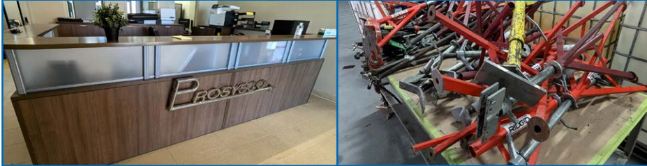
PARTIAL VIEW OF PLANT SUPPORT