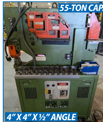
MUBEA HPSN 500 HYDRAULIC IRONWORKER

Visit infinityassets.com for complete specifications. Bid Online at BidSpotter.com