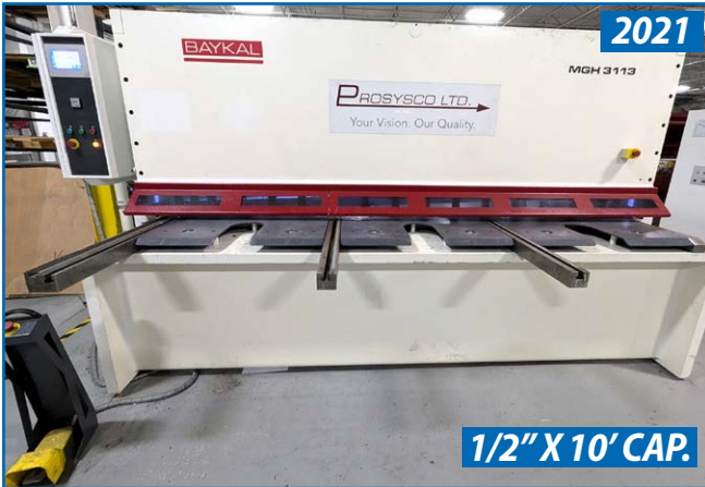
BAYKAL MGH 3113 CNC HYDRAULIC SHEAR

World-Class Provider of Custom Engineered Solutions for Pharmaceutical & Beverage Industries Complete Stainless Steel Fabrication Facility