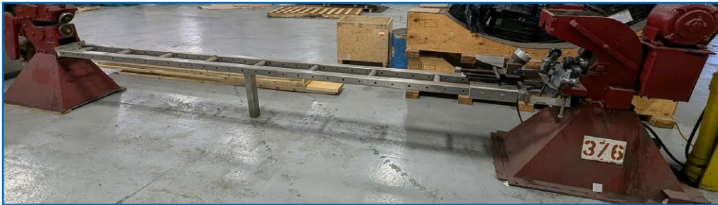
CUSTOM EDGE FORMING / BEVELING MACHINE