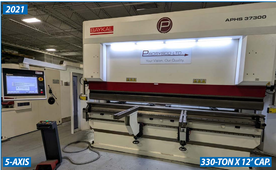
BAYKAL APHS 37300 CNC HYDRAULIC PRESS BRAKE