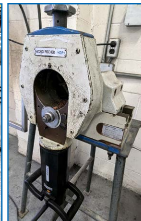
GEORG FISCHER RA4 ORBITAL SAW