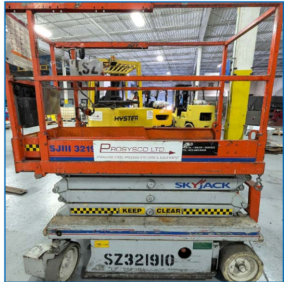
SKYJACK SJIII 3219 SCISSOR LIFT