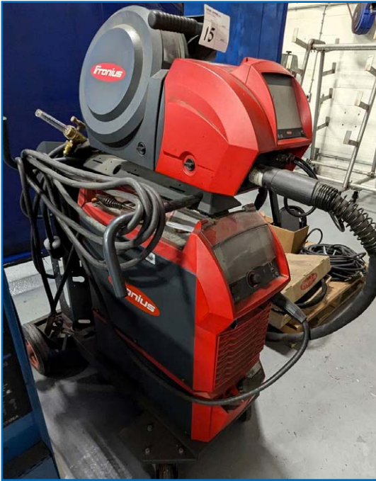
FRONIUS TPS 400I PULE WELDER