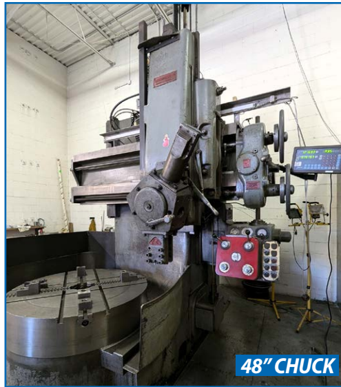
WEBSTER & BENNETT VERTICAL BORING MILL