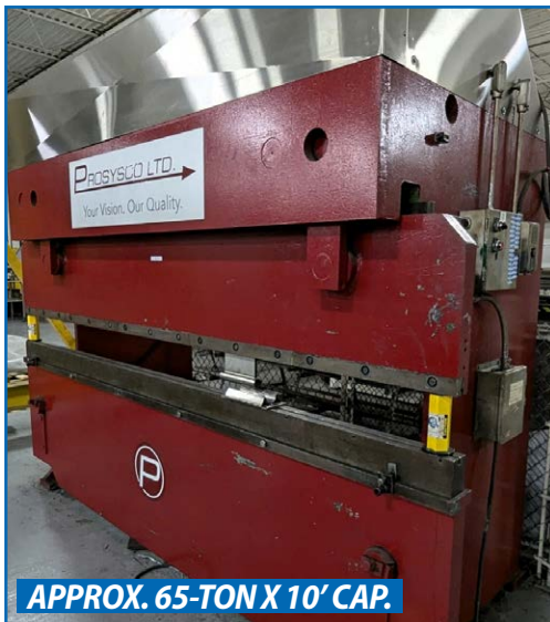
HYDRAULIC PRESS BRAKE