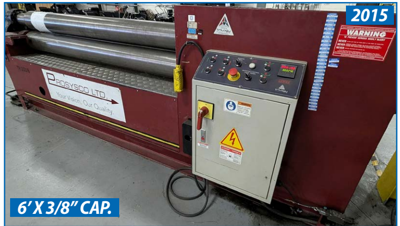
LEMAS TR 200/6 HYDRAULIC PLATE ROLLS