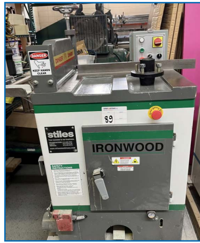
Ironwood Left Hand Pneumatic Under Cut-Off Saw - Model 18L