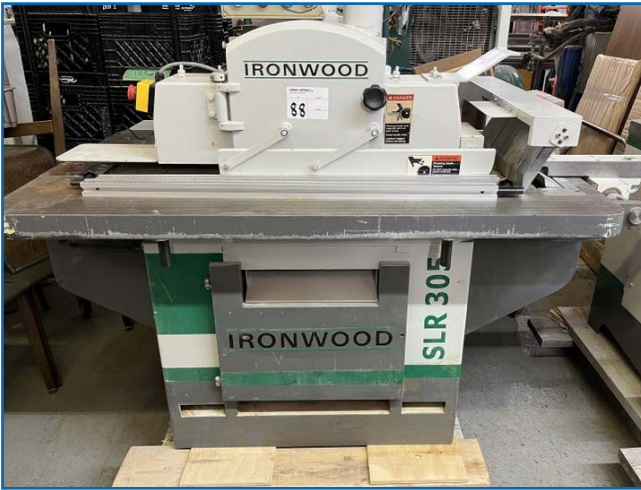
Ironwood SLR-305 Straight Line Rip Saw