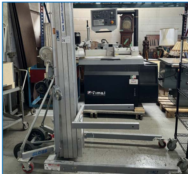
Genie Superlift Contractor, SLC-18, 650 lbs Load Capacity, Lift Height 18' 6", Load & Transport