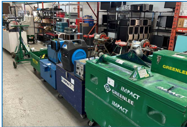
Greenlee 1818 Conduit Bender & Greenlee 1800 Mechanical Bender