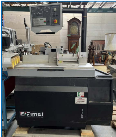
FIMAL (Paoloni) Spindle moulder TX160L w/ tilting shaft