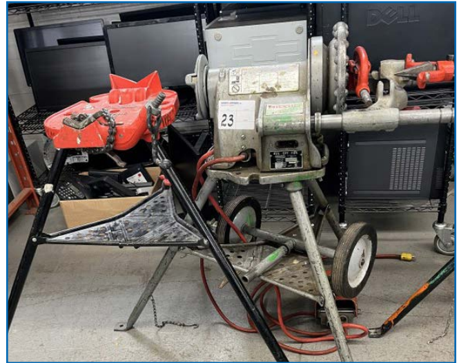
Ridgid 15682 Model 300 Complete Pipe Threading Machine, 115V & Ridgid No. 450 TRISTAND PIPE VISE 1/8