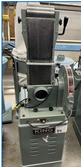
King Industrial 6' x 48' Belt & 12' Disc Sander, KC-788FX