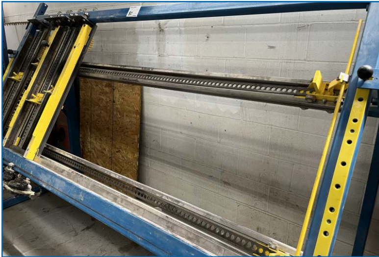
JLT 79K-8-DDC 387x977 Capacity Pneumatic Double Door Camp

Location: 30 Millwick Drive, Toronto, Ontario M9L 1Y3