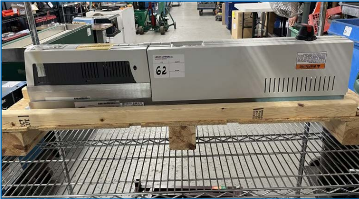
ABB ACH550-PDR-052A-6 Assembly / ACX550-U0-052A-6 Ac Drive 50HP 500/600Vac 52A